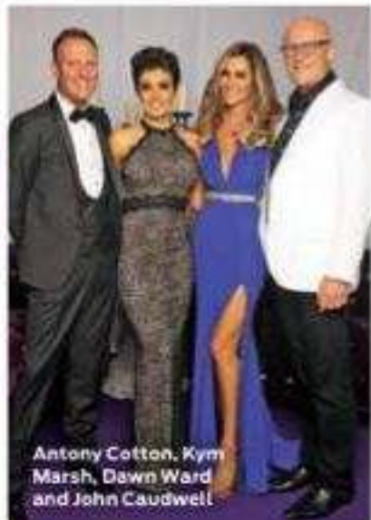
Antony Cotton, Kym Marsh, Dawn Ward and John Caudwell