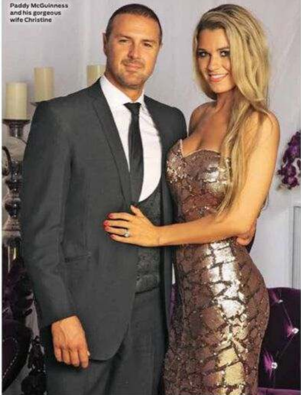
Paddy McGuinness and his gorgeous wife Christine

charity which provides support, equipment and treatment for disabled children and their families across the UK, with the money being specifically used to fund Destination Dreams, a project that's aiming to send 25 terminally ill children and their families on the holiday of a lifetime to Florida.