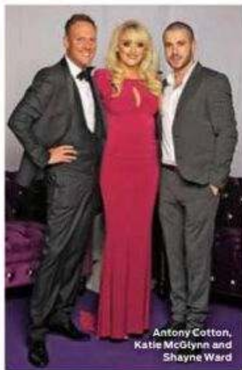
Antony Cotton, Katie McGlynn and Shayne Ward

Antony Cotton, who plays Sean Tully, wasn't nervous about the live episode because he's done it before. He told us: "It's not my first time at the rodeo. I will be nervous on the night but you have to see it for what it is, an episode of event television that's supposed to be fun. There are some